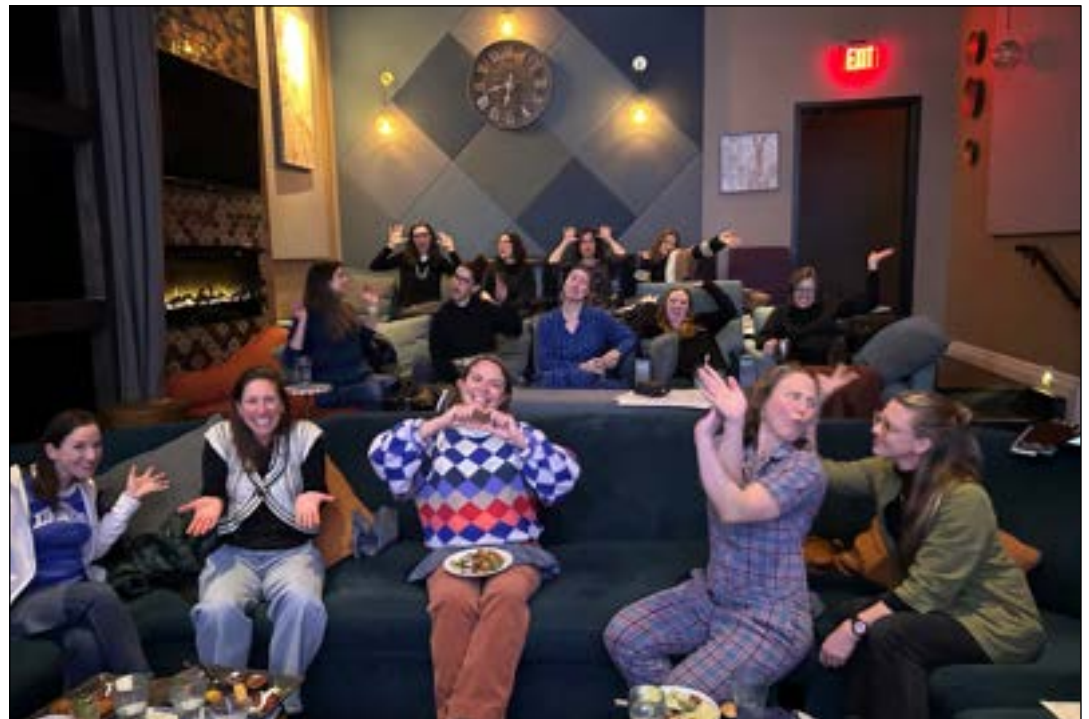
The Jewish Federation of Greater Portland's Gather Grant program has awarded nearly 100 grants for small-scale Jewish community building events, like the one shown in this photo submitted by an event host, in its first two grant-making cycles. A new cycle for summer events opens tomorrow.

"I think I most enjoyed seeing how much people appreciated having something organized for them so they could come and enjoy each other's company," one host