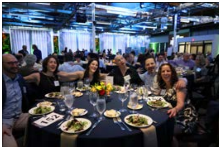
BB360 celebrates its annual BB Bash fundraiser Saturday, Apr. 26 in Portland.